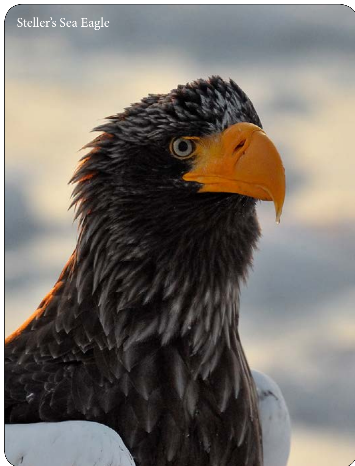
Steller's Sea Eagle

Time: 18 - 28 February 2018 Price: 4550 € per person single supplement 835 €