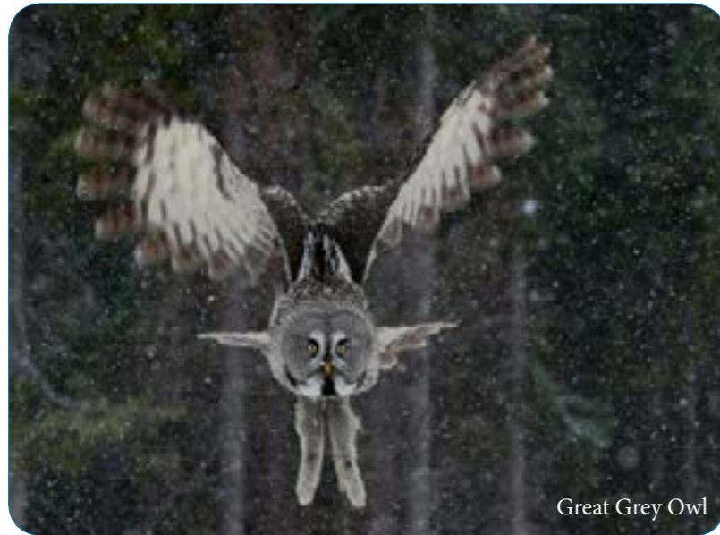
Great Grey Owl