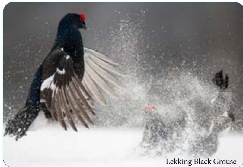
Lekking Black Grouse

Picnic lunch in the hide and dinner and accommodation in Oivanki.