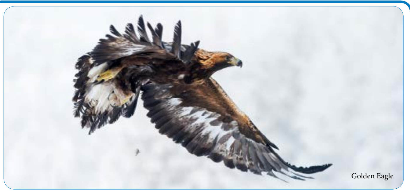
Day 4 - 5 Kuusamo area

Once again, to take the full advantage of the long spring days, we depart for our hides in the stillness of the very early pre-dawn hours. After settling into our comfortable hides we then wait for our latest photographic quarry, the mighty Golden Eagle. These truly magnificent birds of prey are both a pleasure and an exciting challenge to photograph. We take on the challenge and photograph them as they perch against a range of different backgrounds as well as while they interact with one another.