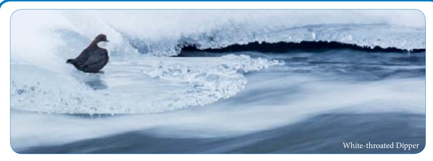
Davs 4 - 5

The same program applies for the next two days: After breakfast departure for a full day photography session in our professional White-tailed Eagle hide. The site is good for flight shots of eagles and the few dozen Ravens that visit the site. Also, Wolverine is a regular visitor and with good luck it may come in daylight! Picnic lunch in the hide during the day and dinner and accommodation in Oivanki.