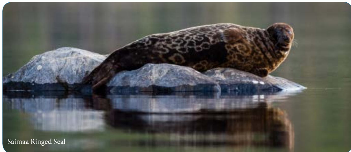
Saimaa Ringed Seal