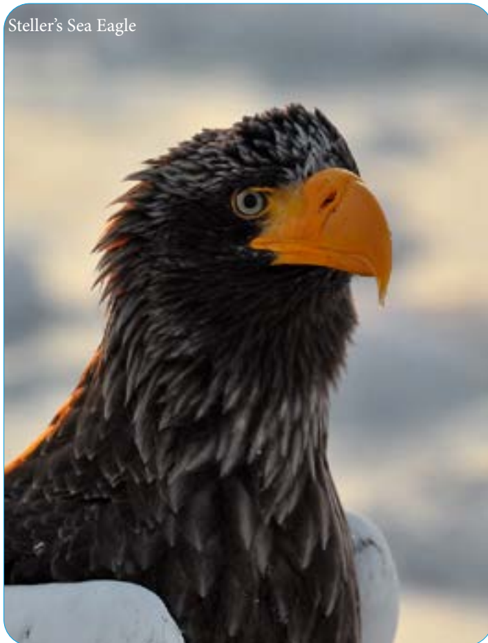
Steller's Sea Eagle

Please notice that there are limited number of single rooms available!