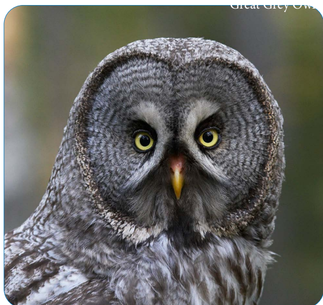
Great Grey Owl

Recommended flights: We recommend to arrive to Kuusamo at 1:25pm (AY489) and depart from Kuusamo at 1:45 pm (AY490).